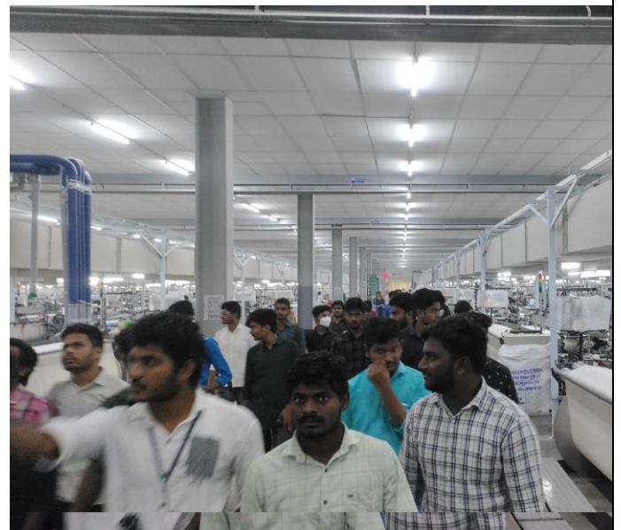
Students listening to the staff at threading section Mohan Spintex India Ltd, Mallavalli