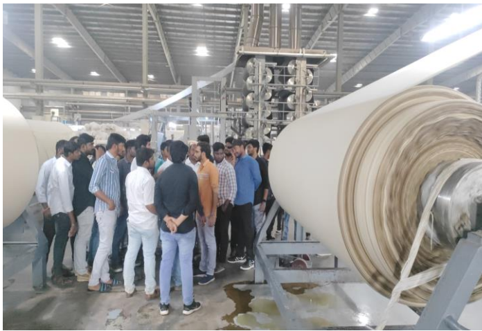
Students listening to the instructions at weaving section given by staff of Mohan Spintex India Ltd, Mallavalli