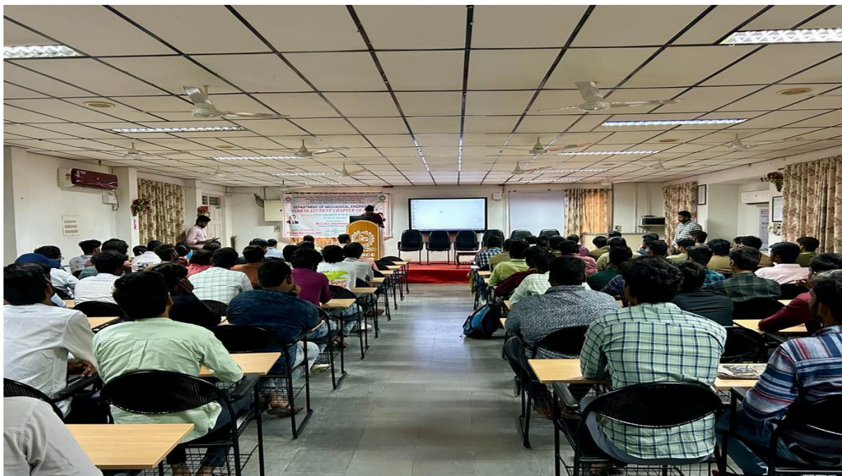
Students attended the ISHRAE Student Chapter Installation Ceremony and Guest Lecture