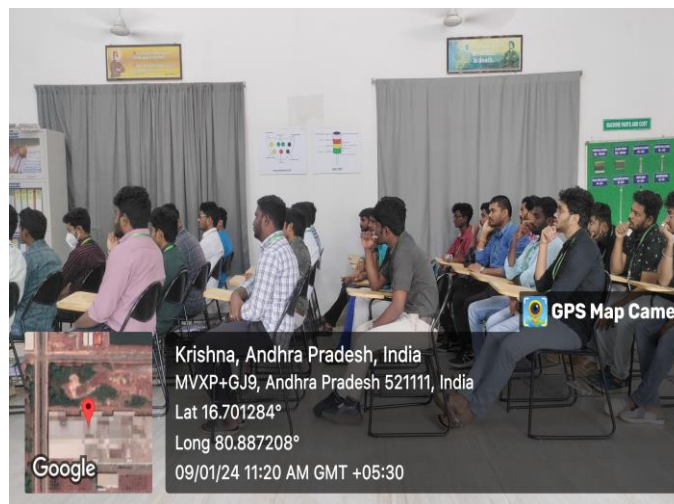
Group Photo of Students at Mohan Spintex India Ltd, Mallavalli