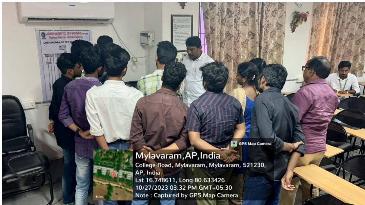
ISHRAE Expert explaining the function of window air conditioner to the students