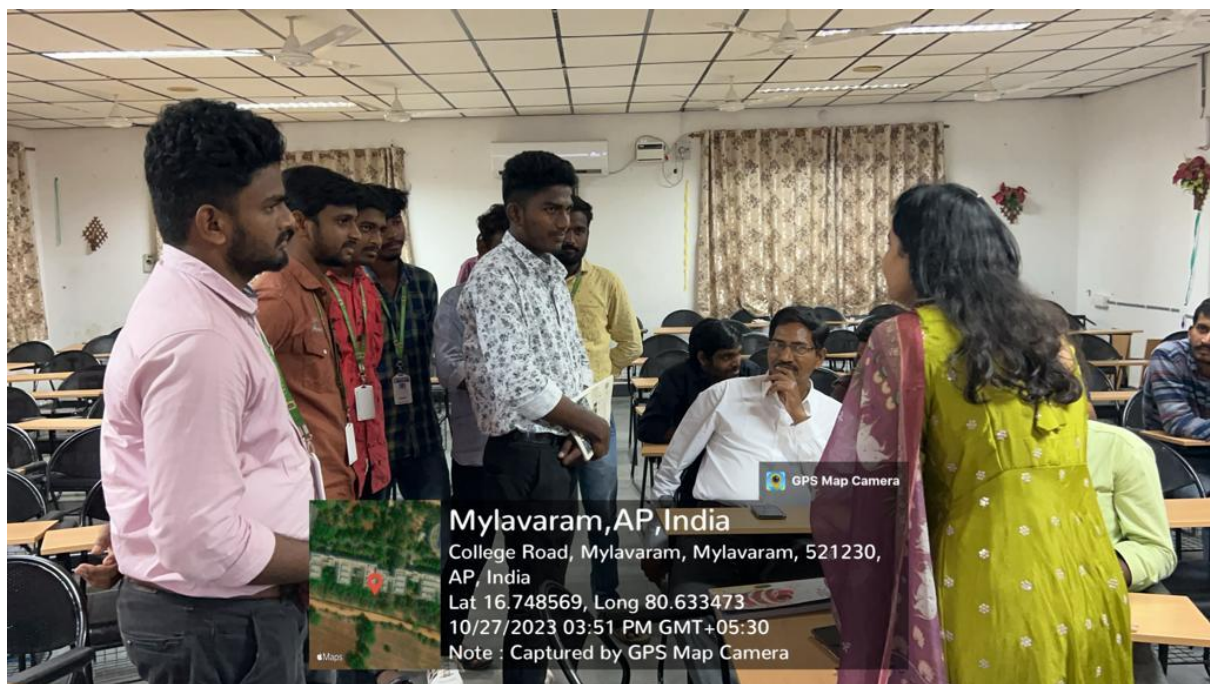
ISHRAE Experts interacting with the student aspirants to become Entrepreneurs