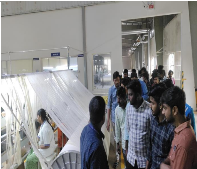
Students listening to the staff of water treatment plant at Mohan Spintex India Ltd, Mallavalli