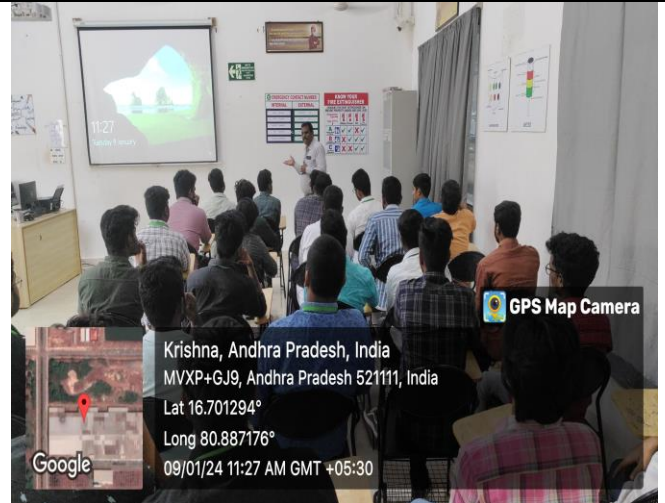
Students listening to the PPT presentation by staff in the conference room at Mohan Spintex India Ltd, Mallavalli