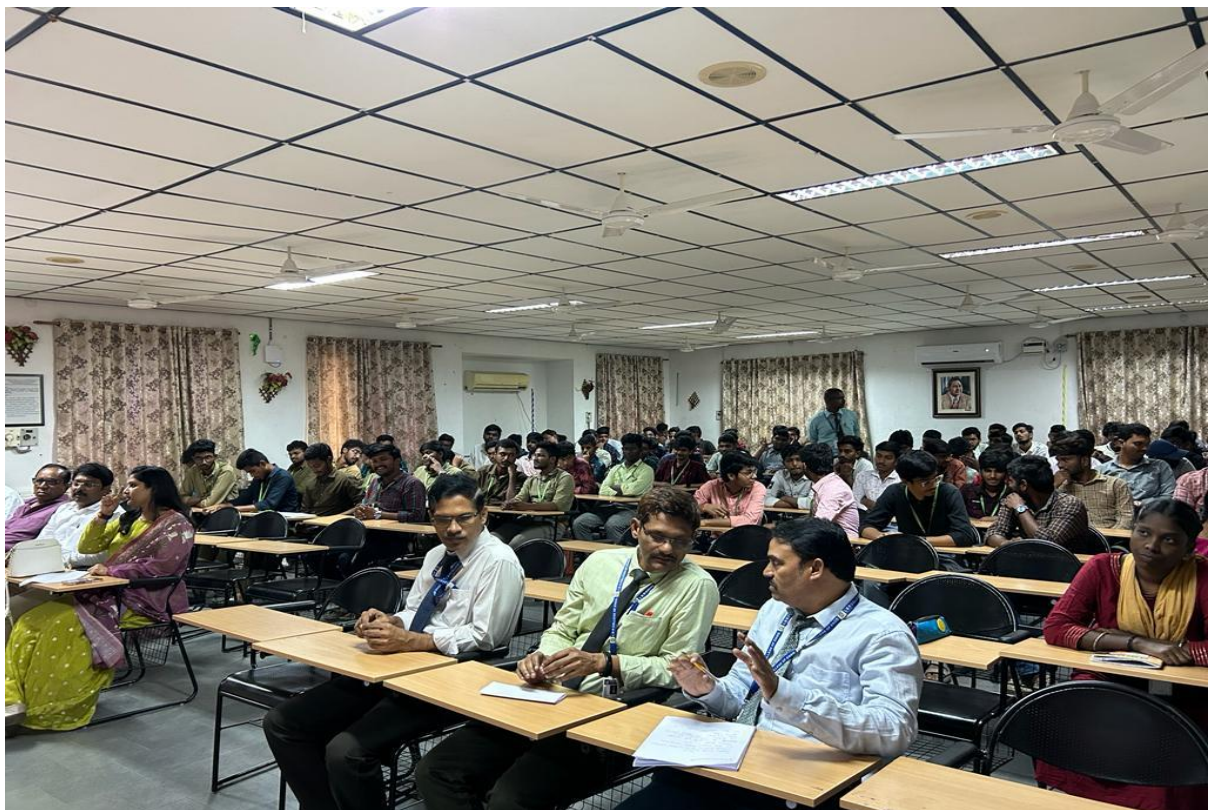
ISHRAE Team members, LBRCE Faculty and Student attendees in the Seminar Hall