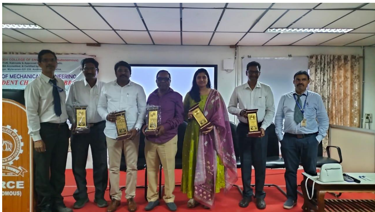
Felicitaton and Memento presented to Team members of ISHRAE Vijayawada Chapter