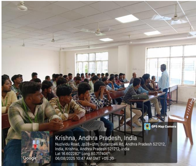
CIPET faculty giving instructions to students at The Seminar hall