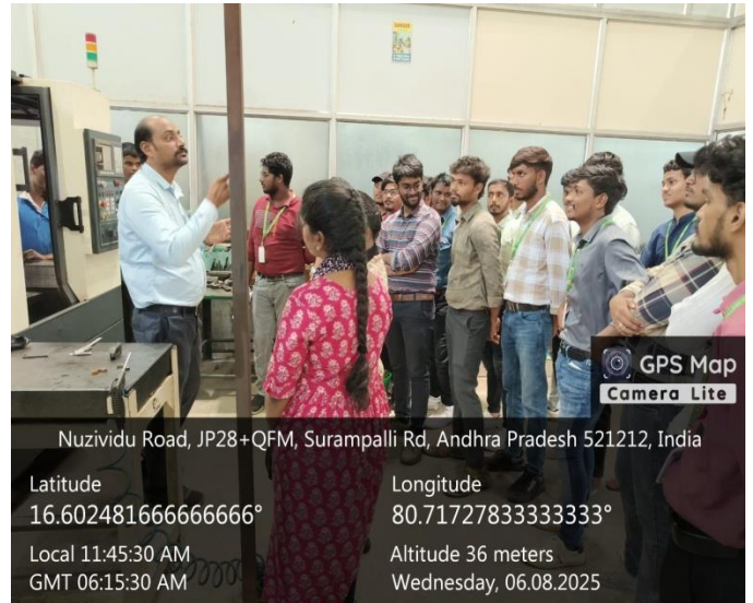
Students observing the Die Sink EDM by the CIPET Instructor