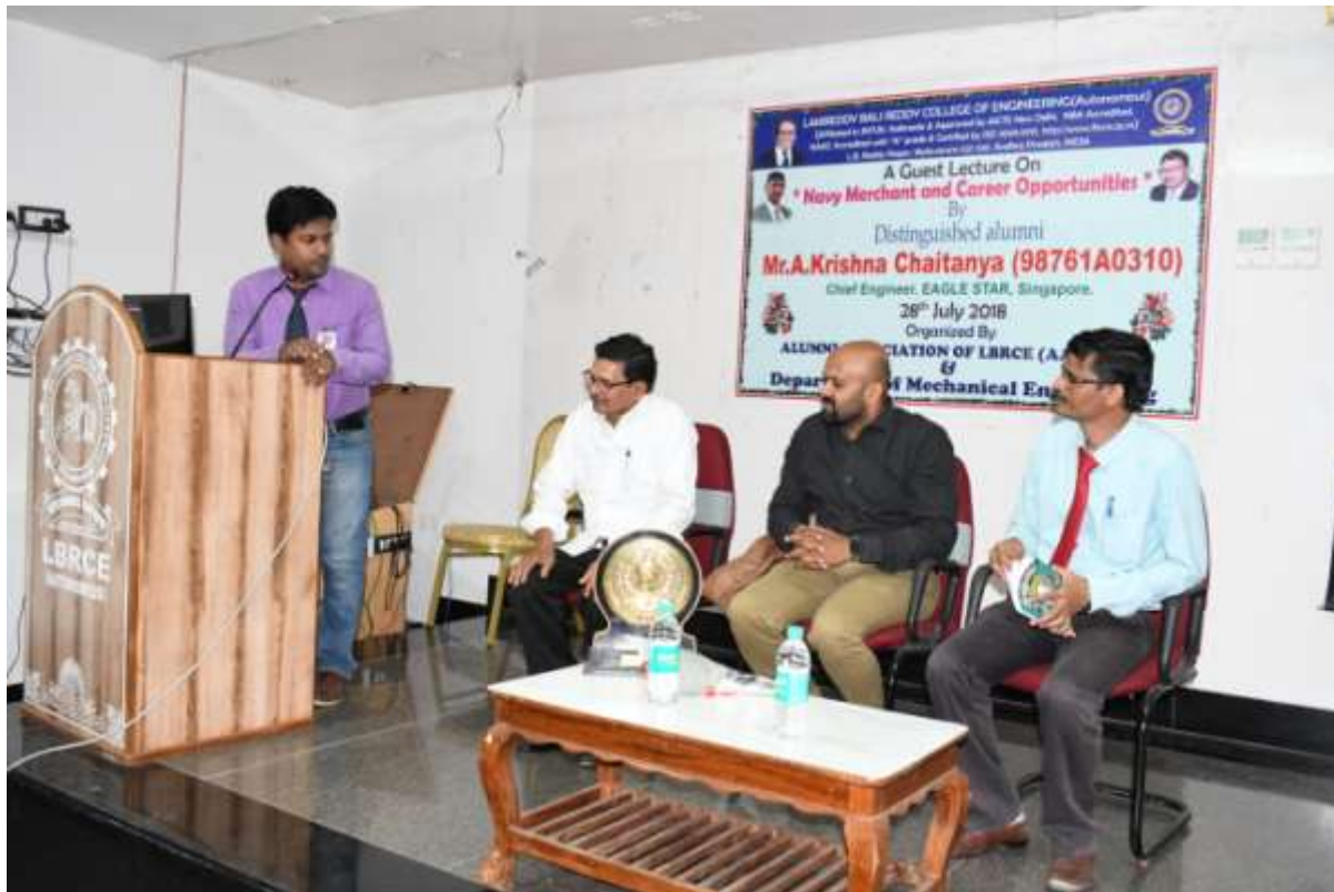
Alumni co-ordinator inviting the guests on to the dais and addressed the gathering.