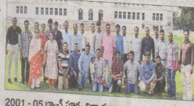
2001 - 05 బ్యాచ్ పూర్వ విద్యార్థులు

మైలవరం: లకిరెడ్డి బాలిరెడ్డి ఇంజనీరింగ్ కళాశాల 2001-2005 బ్యాచ్ మెకా నికల్ విభాగం పూర్వ విద్యార్థుల సమావేశం సోమ వారం జరిగింది. సమావేశం లో ప్రిన్సిపాల్ డాక్టర్