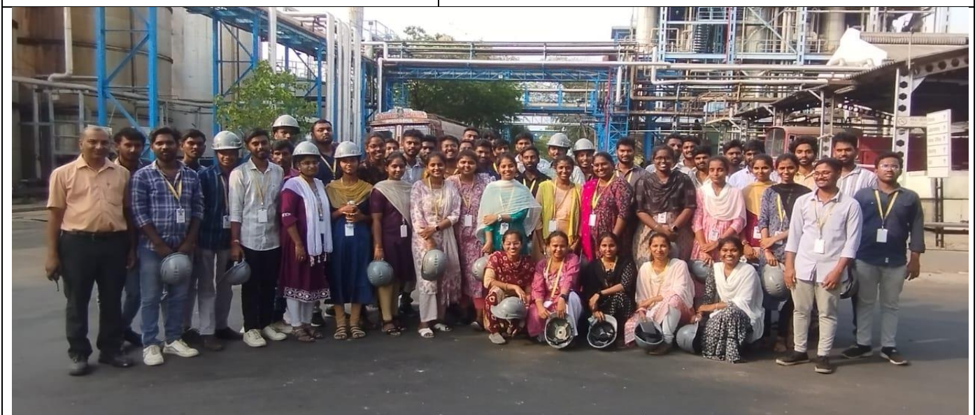
Students Group photo