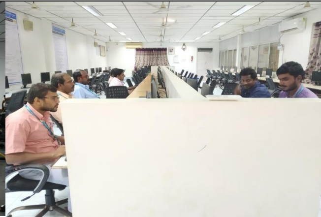
Practical session at IT Laboratory