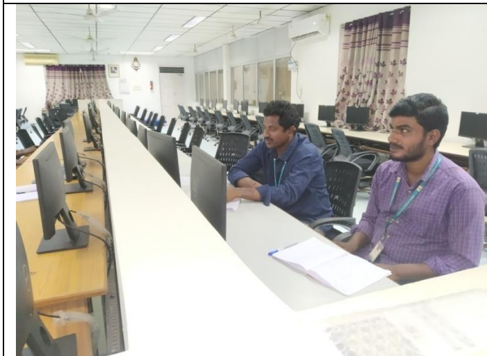
Practical session at IT Laboratory