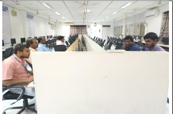
Practical session at IT Laboratory