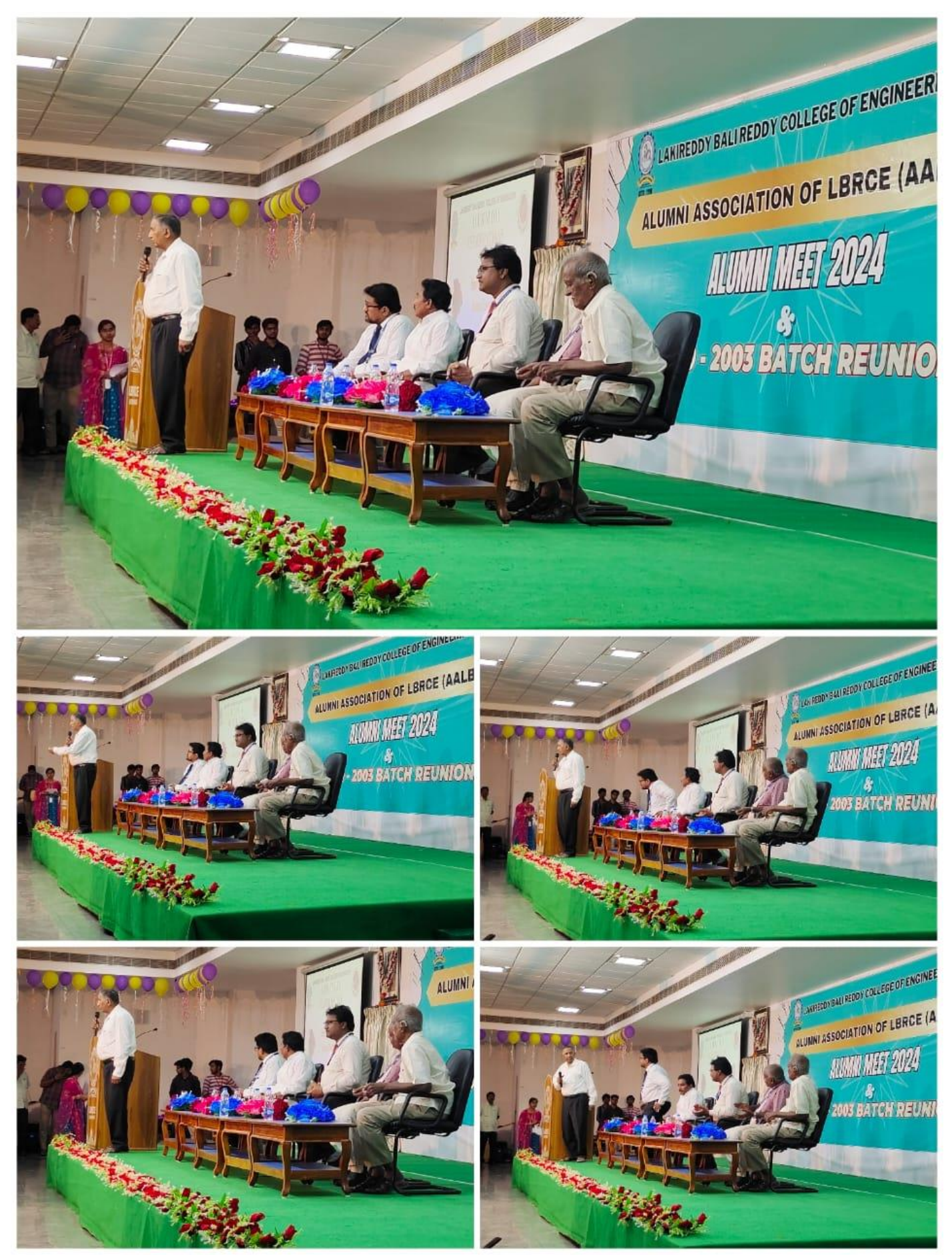
Group Photo of Alumni Meet-2024