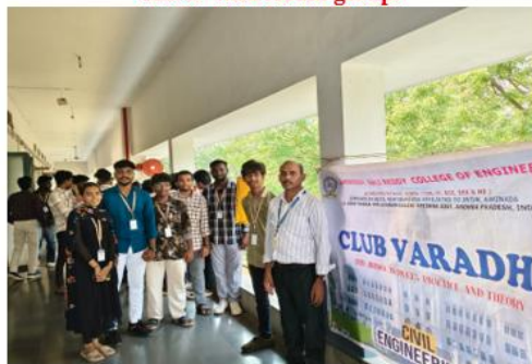
Hackathon competition for 1 st year Students