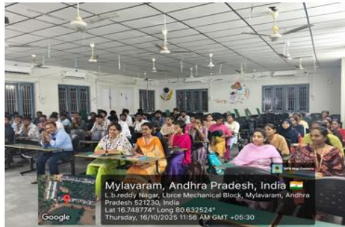
Students participating in Seminars