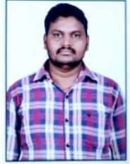
B Narasimha Rao