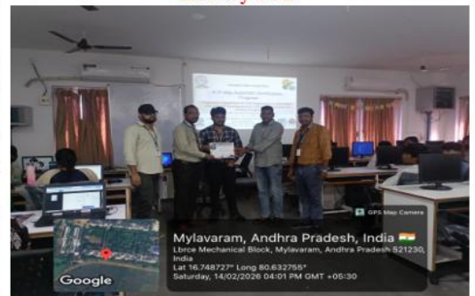
Auto Cad Workshop

Where Innovation Meets Action: Technical, Curricular