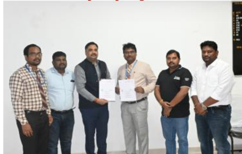
MOU -with Adani group.