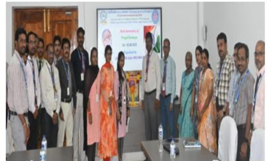
Students Participated in KL Rao Birthday celebrations