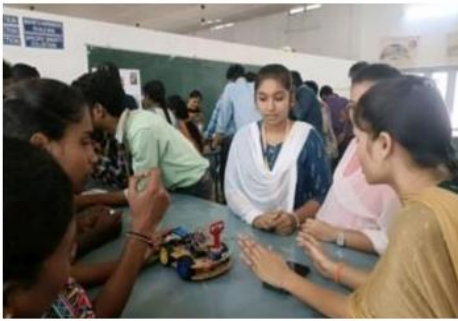
IOT Model Exhibition