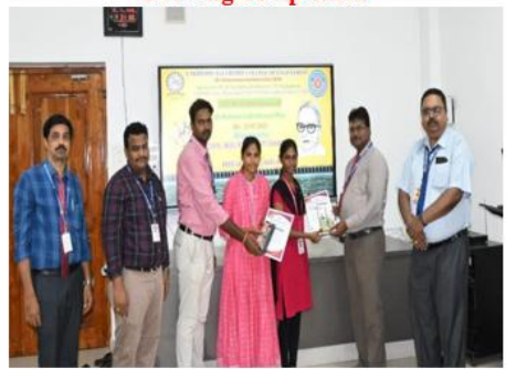
Students participated in NSS activities