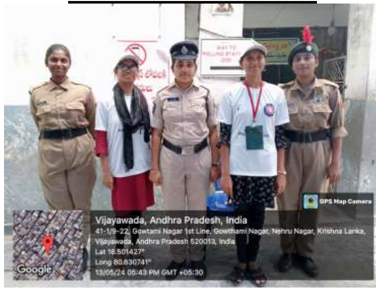
Vijayawada, Andhra Pradesh, India 41-1/9-22, Gowtami Nagar 1st Line, Gowthami Nagar, Nehru Nagar, Krishna Lanka, Vijayawada, Andhra Pradesh 520013, India Lat 16.501427° Long 80.830741° 13/05/24 06:43 PM GMT +05:30