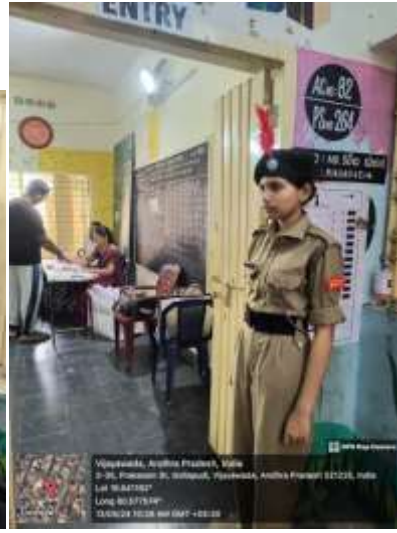
Vijayawada, Andhra Pradesh, India R.111+536, N4-30, Pulkuru, Andhra Pradesh 521210, India Lat 16.830606° Long 80.830136° 13/05/24 08:00 PM GMT +05:30