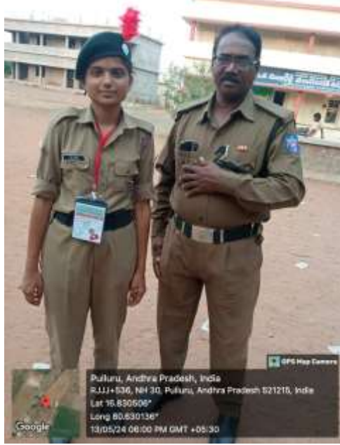
Pulkuru, Andhra Pradesh, India R.111+536, N4-30, Pulkuru, Andhra Pradesh 521210, India Lat 16.830606° Long 80.830136° 13/05/24 08:00 PM GMT +05:30