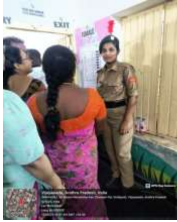
Vijayawada, Andhra Pradesh, India R.111+536, N4-30, Pulkuru, Andhra Pradesh 521210, India Lat 16.830606° Long 80.830136° 13/05/24 08:00 PM GMT +05:30