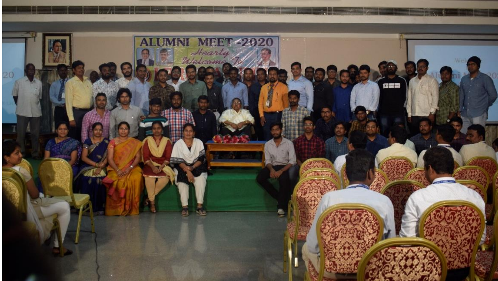
Group Photograph of Alumni Meet - 2020