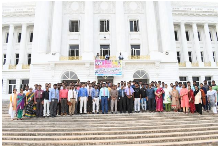
Group Photograph of Alumni Meet - 2019