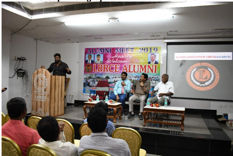
Alumni sharing his views in Alumni Meet - 2019