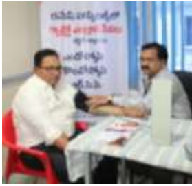
Chairman undergoing health checkup