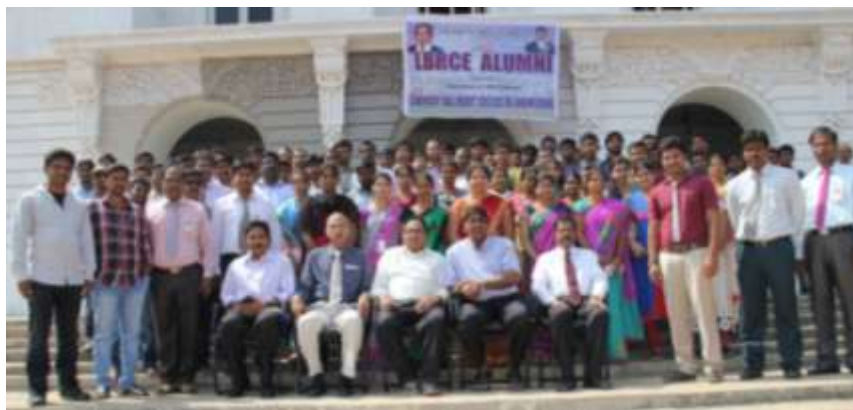
Alumni posing with the Chairman & others