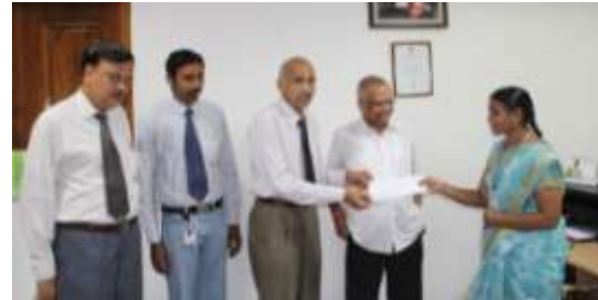
Director handing over donation to beneficiary