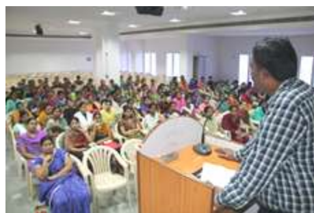
An image from the Workshop